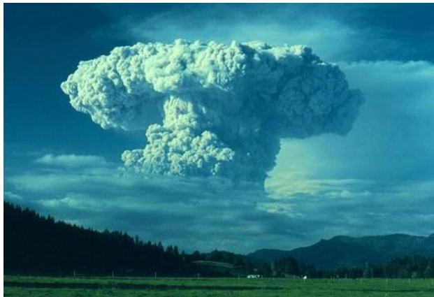
Mt. St. Helens eruption – July 22, 1980